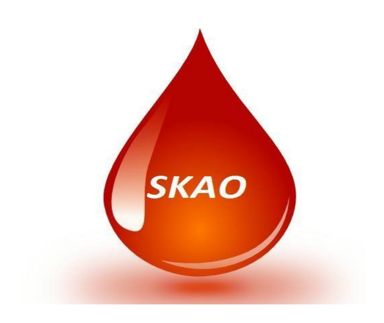
Jakkaram, J.P. Road, Bhimavaram